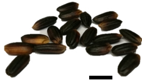
Figure 1 Tadong grains (Scale bar = 0.7cm)