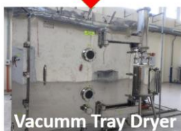
Vacuum Tray Dryer