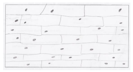
Figure 2 (Obs2, S9b)