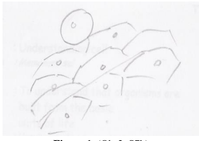
Figure 1 (Obs2, S7b)

The students showed different abilities in drawing specimens. Most of the students drew the specimen similar to what they have observed in text book. Figure 1 and 2 displayed the example of the students' hypothetical drawing of onion cells: