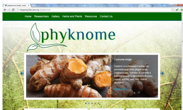
Figure 2 Screenshot of Phyknome ( http://mapping.fbb.utm.my/phyknome/ )

The construction of Phyknome which specializes on ethnobotanical information offers comprehensive database with more than 22,000 species of plants with nutritional value based on ethnobotanical data primarily from local culture. The content contains taxonomy classification of the specific plants, medicinal usage and active compound that is readily accessible