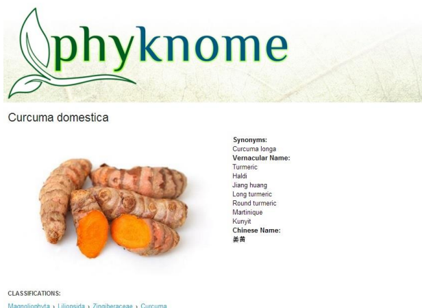
Figure 3 Featured plants showing exemplar species pages