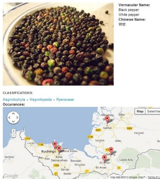
Figure 4 Exemplar of GIS data