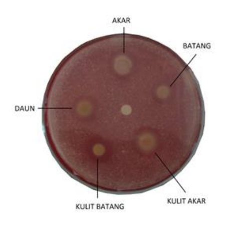
Figure 2 Staphylococcus aureus

Test results of antibacterial activity against Shigella boydii and Staphylococcus aureus showed a clear zone which indicates the presence of inhibition. Measurement results of DDH DDH values obtained are listed in Table 1.