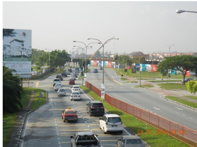
Figure 1 Layout one of the intersections studied (Site B)

Data pertaining to the analysis of the factors that influence the decision of the drivers at the onset of amber was collected using a video recording technique. The advantages of using a video recording technique for traffic data collection has been described by various researchers [22, 23]. The observation of each driver's behaviour was made when the vehicle was about 150 m from the stop line. Parameters extracted from video playbacks are vehicle's approaching speed, position of vehicle in the platoon, types of vehicle driven and distance from the stop line. Data extraction process was carried out using an event-recorder computer program. The analysis of the data was carried out using SPSS computer program.