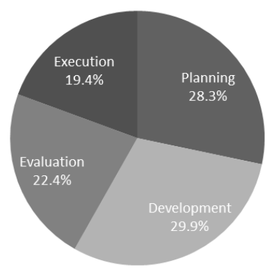
Figure 1 The four domains of LP from review

The ability in increasing the maturity of the process of each domains potentially increase operational control with more efficiency [10]. This is essential in synthesizing process and streamlining each of the domains either at the beginning phases of the LP implementation or after it has been adopted [11]. The percentage of the domain category that was highlighted from the literature review of each domain identified in the LP implementation process is summarized in Figure 1.