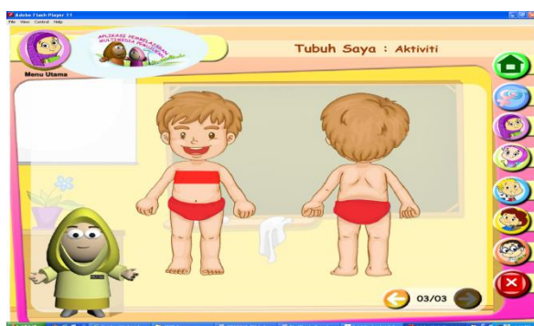
Figure 5 A screenshot of which children rehearse scream "Jangan sentuh saya" while other people touch on their private part

Additionally, Figure 5 applies both principles. It shows a situation where children scream "Jangan sentuh saya" when someone touches their private parts. This study fully understands that even though this issue does not involve the reality of children life, this principle is able to create a sense of awareness among children of the dangerous situations that they should avoid.