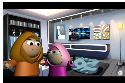
Figure 4 Screenshot shows in the conversation between mother and daughter that apply voice principle