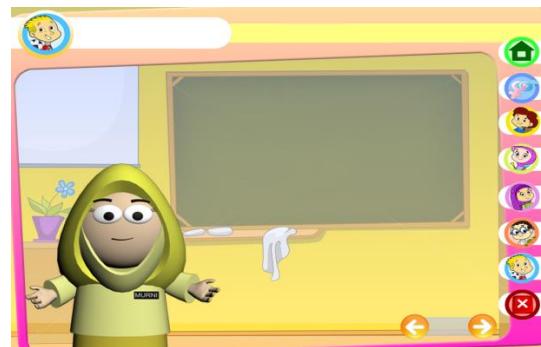
Figure 3 Screenshot which apply personalization principle

The personalization and voice principle appear through the characters. There are a mother and a teacher interacting with children, explaining and suggesting on what children should do when facing dangerous situation. When children are engaged with the teacher in the application, who talks to them, they perceive the teacher as a conversational partner and therefore they will try to understand and make sense of what the teacher say. This can be seen in Figure 3