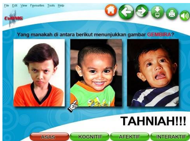
Figure 3 The sample game screen shot