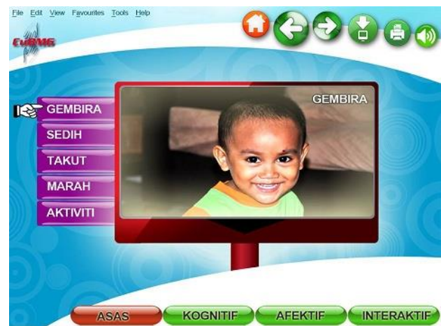
Figure 2 The main menu of CuBMG

Based on the above framework, the culture-based multi-modal mind games will be developed. Figure 2 shows a proposal for the main menu of the games which consists of 4 basic modules: Foundation Skills, Interaction Skills, Affective Skills and Cognitive Skills. If the user choose Foundation button, there will be submenu to choose: HAPPY, SAD, AFRAID and ANGRY. There is also an ACTIVITY option button to be chosen. Under this activity, random pictures will be shown to the child and they are expected to choose the correct picture as can be seen in Figure 3. The audio and text will notify them upon successful answer or ask the child to re-select the correct answer if the first attempt fails.