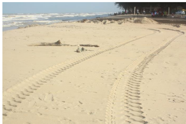
Figure 6 Example of continuity

Proximity is shapes or objects that are close to each other and appear to form a group as shown by Figure 6. Even if the shape, size, or the object itself is not the same, they will look good when they are close all together.