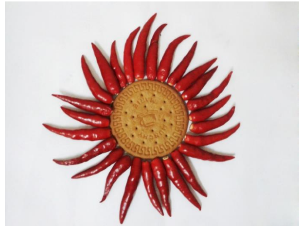
Figure 5 This is the example of proximity, although they had different shape and colours, but it look good when combine together

correspondence can still be discernable. Similarity (or repetition) is a picture that often has connotations of harmony and interrelatedness, or rhythm and movement. Figure 5 shows the example for this similarity approach.