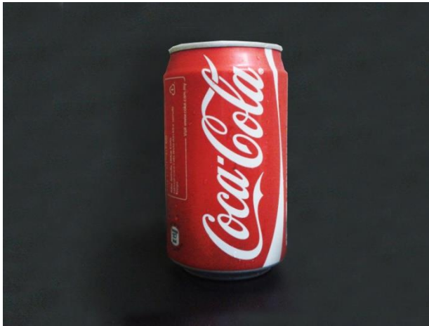
Figure 3 This is the example of figure ground, which is the subject is more prominent than the background

a longer period of time. The example for closure approach is shown by Figure 3.