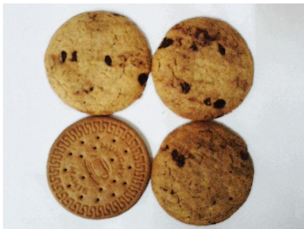
Figure 4 This is the example of similarity, which is the shape of subject are similar but one of them had different pattern

Figure ground is where the subject is more prominent than the background as featured in Figure 4. This highlights the main subject to the viewer, based on a number of possible variables, like contrast, colour, size, etc. Anything that is not a figure is considered as ground. As our concentration shifts, the ground will shift; and the object goes from figure to ground and back again. Ground is also thought of as being negative space or background.