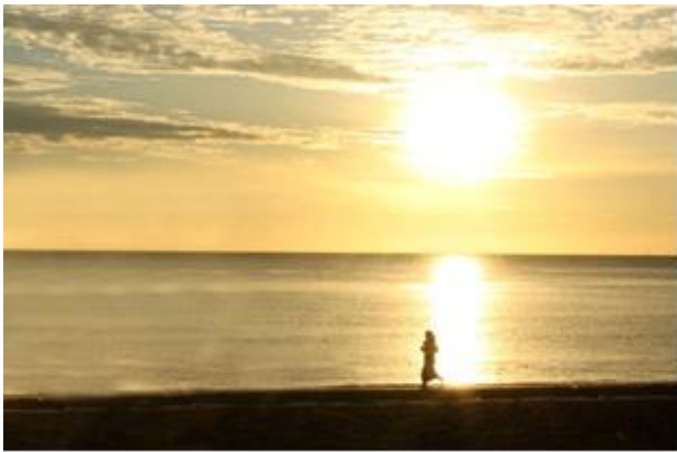
Figure 7 This is the example of common fate, which is the object move in different direction

Common fate is an object that moves in the same direction that is related to another, rather than an element that appears to be moving in a dissimilar direction as shown in Figure 7. The entire related object shares a "common fate". These six rules will be applied in a photography project. Students will learn how to shoot photographs and apply these rules in their work.