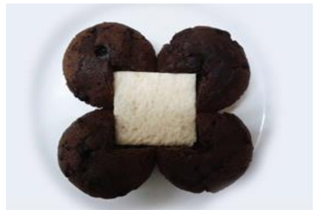
Figure 2 This is the example of closure, which is the empty space had been filled

Capability refers to skills in photography, accustomed learning in a new environment using gestalt theory. Skills in photography include the capability to identify gestalt theory in a photograph. Accustomed learning in a new environment includes students fitting themselves to learn in a new educational environment in a virtual game. Gestalt theory learning includes being capable of understanding the six rules of gestalt. The six rules of Gestalt are closure, figure ground, similarity, proximity, continuity, and common fate as for example shown by Figure 2.