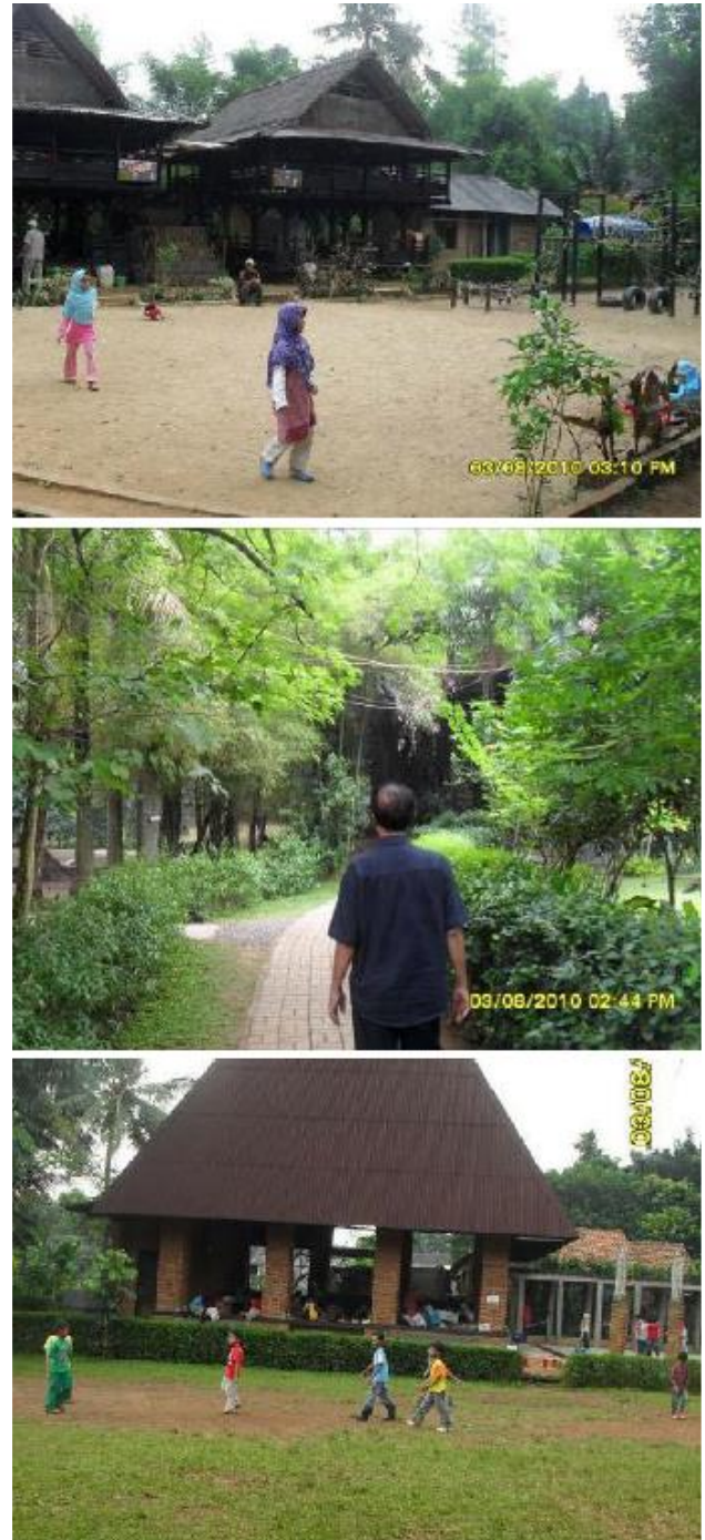
Figure 2 Surroundings of Sekolah Alam Ciganjur

This green school using 3 concepts in learning and teaching which are Akhlaqul Karimah (teach the child to have an excellent moral with the main method based on Qur'an and Hadith), Knowledge Philosophy (teach the child having a manner logical thinking, respect the nature and surrounding and use it as learning media with the action learning and discussion), Leadership (teach the child to have an excellent leadership spiritual through the 'Out Bound' and 'Dynamic Group'). Figure 2 shows the surrounding of this school.