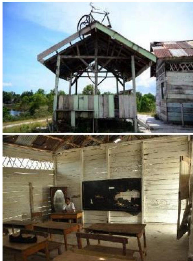
Figure 3 Rainbow troops by Andrea Hirata

Laskar Pelangi (English: The Rainbow Troops) is a 2008 Indonesian popular novel by Andrea Hirata. The novel follows a group of 10 schoolboys and their two inspirational teachers as they struggle with poverty and develop hopes for the future in Gantong Village on the farming and tin mining island of Belitung off the east coast of Sumatra. The novel, set in the 1970s, opens on the first day of the year at a Muhammadiyah elementary school on Belitung. The school needs 10 students but is one short until near the end of the day, when a straggler fills out the ranks for their teachers, Muslimah and Harfan. Muslimah dubs the children "The Rainbow Troops" (sometimes translated as "The Rainbow Warriors") and the novel traces their development and relationships with the teachers. Figure 3 shows rainbow troops by Andrea Hirata