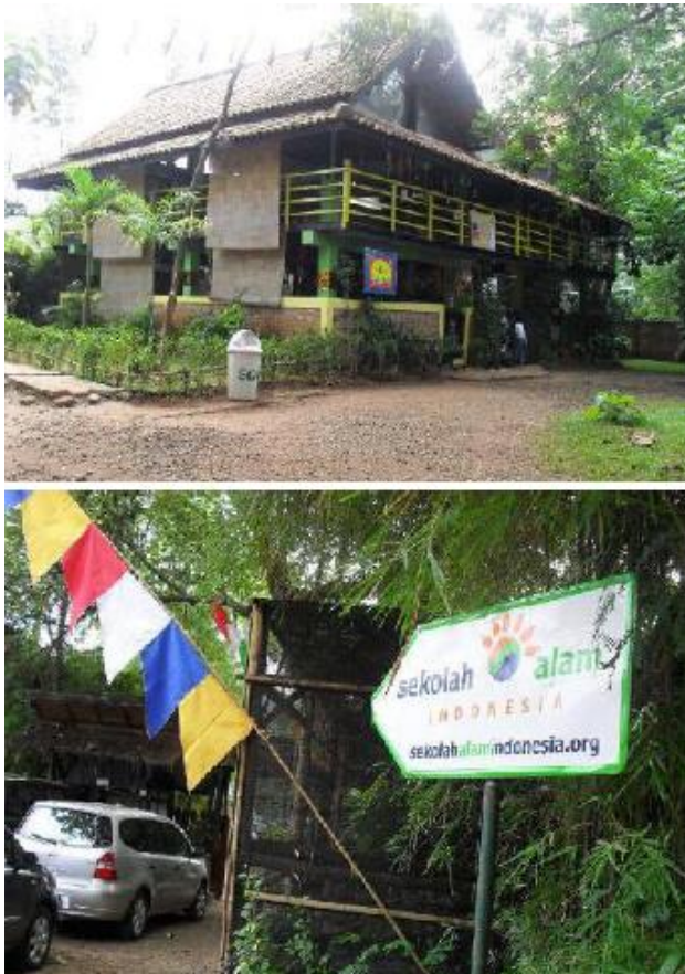
Figure 1 Green School of Ciganjur

This green school using 3 concepts in learning and teaching which are Akhlaqul Karimah (teach the child to have an excellent moral with the main method based on Qur'an and Hadith), Knowledge Philosophy (teach the child having a manner logical thinking, respect the nature and surrounding and use it as learning media with the action learning and discussion), Leadership (teach the child to have an excellent leadership spiritual through the 'Out Bound' and 'Dynamic Group'). Figure 2 shows the surrounding of this school.