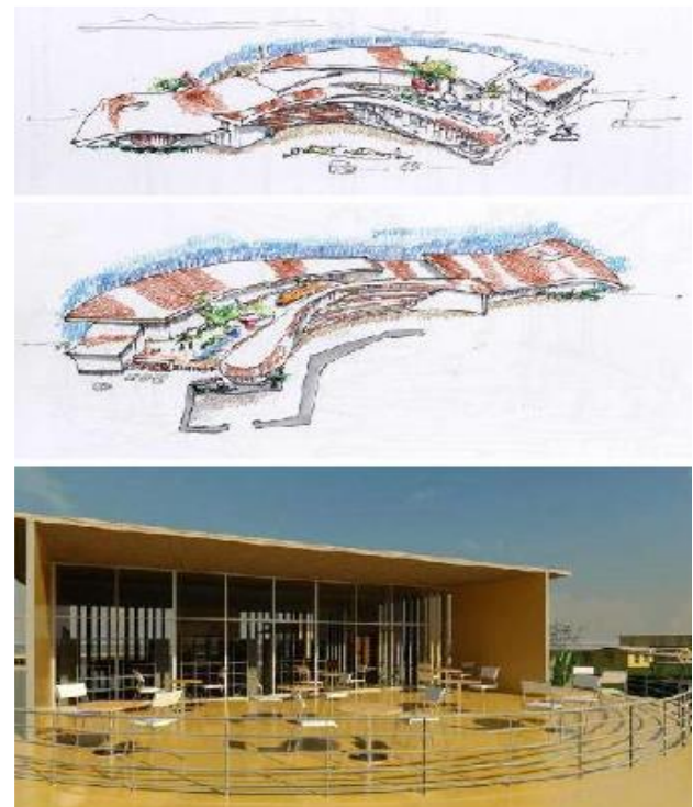
Figure 5 Sample of design scheme produced

Due the limitation of the space this papers only discuss two schemes which was proposed by Nuraini and Fatihah. Both of the scheme start with identifying spaces which then customized for the specific needs of the primary school children. Along with input lecture in the studio, characteristic of the spaces and its border then slowly defined. As can be seen in the picture below the focus of the design is not on the normal classroom lay out as we normally seen in the school but on the outdoor space to cater the outdoor activity. Its seem like a landscape design but actually the whole exercise sharpen the students skill in integrating outdoor and indoor spaces especially on the defining of the school's master plan. The design then slowly detailed up until its technical detail. Figure 5 shows sample of design scheme produced.