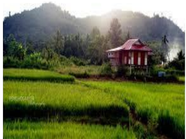
Figure 2 A setting of a house in the middle of paddy field in the rural Malay village

To understand the concept of the Malay village with its cultural landscape setting, we have to look at it from both its macro environment as well as its micro setting. The village is viewed as a whole in relation to its surrounding natural landscape and the Malay house in relation to its compounds and garden setting. The evolution of the Malay village is the result of the interrelationship between man and his surroundings, man and his inherent cultural attributes and the need to survive. These influences have helped shape the course of actions taken by the Malays in the design and composition of their habitat into a cultural responsive landscape. Figure 2 presents a setting of a house in the middle of paddy field in the rural Malay village