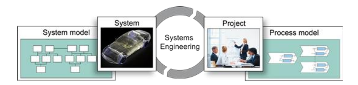
Figure 1 The concept of systems engineering

multidisciplinary system and covers the entirety of all development activities. Therefore, interdisciplinarity and the targeted are holistic analysis of problems are paramount. Systems engineering addresses the system to be developed and the associated project in equal measure. Beyond the central tasks of product development, it considers the mutual dependencies of these activities [2] (Figure 1).