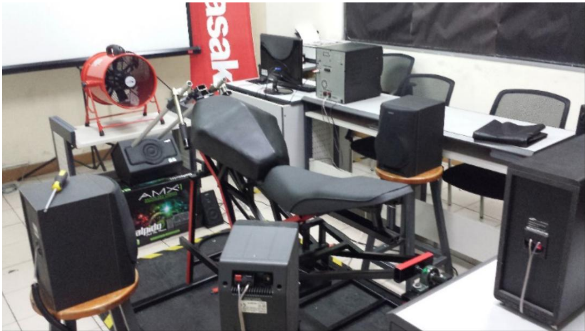
Figure 1 Postura Motergo™ from METAL, UiTM [5, 6]

The Postura Motergo™ is a revolutionary motorcycle test rig established by a group of researchers from the Motorcycle Engineering Test Lab (METAL™) of Faculty of Mechanical Engineering, Universiti Teknologi MARA (UiTM) Malaysia (see Figure 1). It is a custom-made motorcycle test rig that utilized the Riding Posture Classification (RIPOC) system [5-7] as functionality reference i.e. the motorcycle test rig could cater for adjustability features to replicate the 4 types of riding postures as noted by the system. Nevertheless, the Postura Motergo™ requires a number of designs improvements.