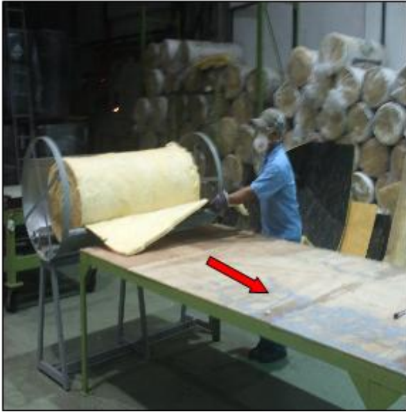
Figure 2 Fibre insulator dispenser (FID) – pulling the leading edge of glass fibre sheet to unroll the fibreglass roll