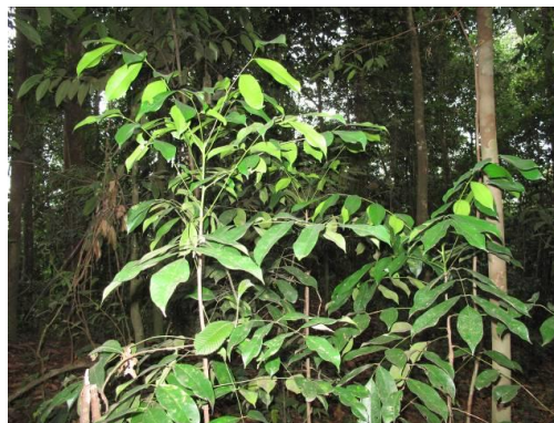
Figure 1 Q. Borneensis Noot.

deposited in the Herbarium. Plant's samples were classified to twigs, wood, leave, root and bark before they were processed to powder form and stored in a -15°C chill room. The voucher specimen is deposited under the identification number SAN 152508.