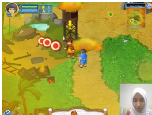
Figure 1 The design of computer games used in the study