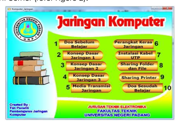
Figure 2 Main menu of interactive CD for computer network

The main menu has buttons which can be used to go to the content pages of computer network materials. There is a header on the left top, and the control button of the main menu to minimize and close, in the right corner (refer Figure 2).