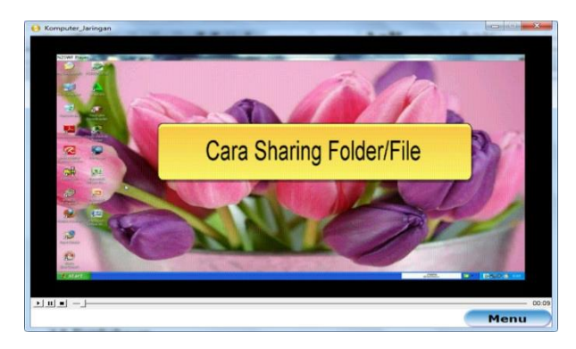
Figure 7 Sub Menu layout of folder and file sharing steps in computer network

Module of folder and file sharing discusses about the steps to share a folder and file in the computer which has been connected to the network. The discussion is presented in the audio visual form (refer Figure 7).