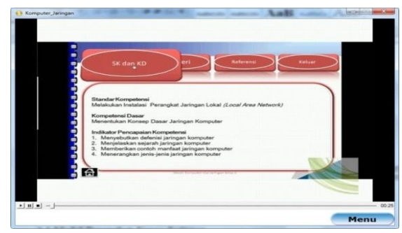
Figure 3 Sub menu layout of computer network basic concept

The module of basic network concept is divided into three parts, i.e. network basic concept: (1) network basic concept, (2) network basic concept, and (3) Network basic concept which collectively explains about the basic concept of the computer network (refer Figure 3).