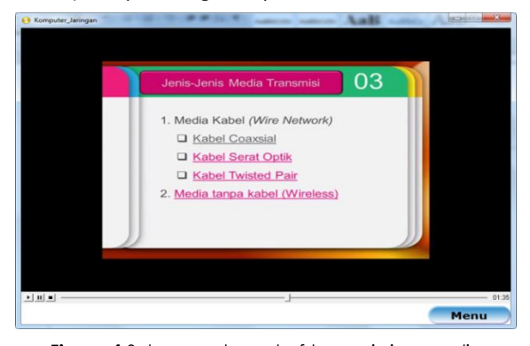
Figure 4 Sub menu layout of transmission media

The module of transmission media presents the type of media which can be used as a data transmission media in computer network, and is presented in audio visual layout (refer Figure 4).