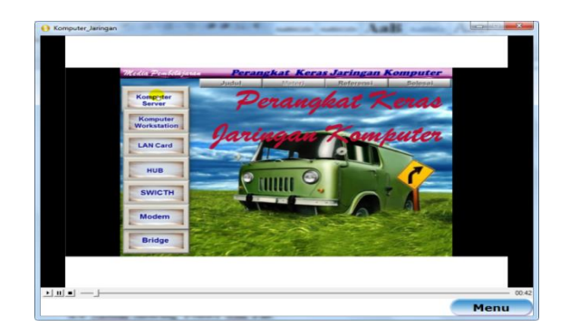
Figure 5 Sub menu layout of computer hardware

The module of hardware network discusses about the hardware of network, i.e. server computer, workstation computer, LAN card, HUB, Switch, Modem and bridge, which are presented in the audio visual layout (refer Figure 5).