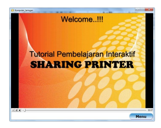
Figure 8 Sub menu layout of Printer sharing steps in the computer network

The module of printer sharing discusses about the steps for printer sharing in the computer which has been connected to the network. The discussion is presented in the audio visual layout (refer Figure 8).