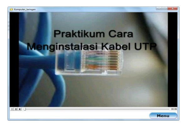
Figure 6 Sub menu layout of UTP cable installation to make computer network

Module of UTP cable installation discusses about the steps of doing the UTP cable installation and RJ45 connector which is presented in the audio visual layout (refer Figure 6).