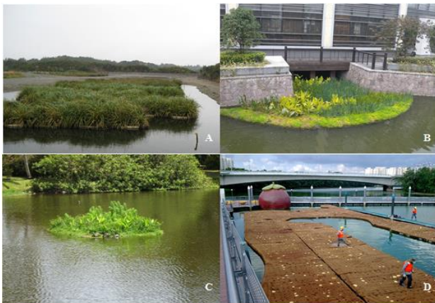
Figure 2 Commercial FTWs applied in different locations, i.e. New Zealand (A), Shanghai (B), Canada (C), and Singapore (D) [48]

Detection on high concentration contaminant in Citarum watershed is attracting several concerned parties in Indonesia, including the government. Several strategies have been applied to decrease the pollutant input in to the water i.e., enjoyment of free flow industrial waste, garbage managements, and society building in order to prevents higher pollution. Nevertheless, an effort to restore damaged aquatic environment and water quality is not conducted intensively. There are several obstacles relating to Citarum watershed remediation planning, wide coverage area, less funding availability, and pessimistic opinion and cooperation from the society are caused well-managed remediation is not getting proceeded effectively.