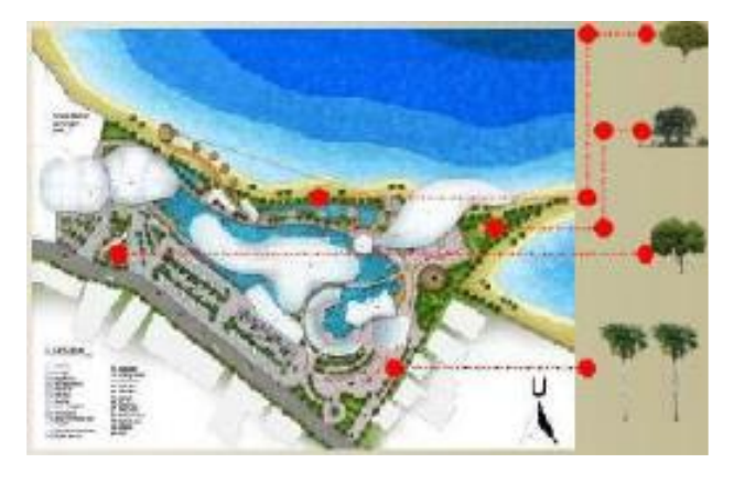
Figure 3 Vegetation is used as an air filter (acid) from the sea breeze

Site conditions that are in the coastal area of air causes the acid will damage building materials, the placement of vegetation as a barrier or filter air before entering the site and building, be an alternative to placement evenly on the beach. Figure 3 shows the vegetation is used as an air filter (acid) from the sea breeze