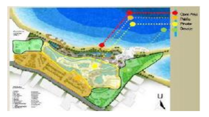
Figure 1 Patterns on the design of mass Sea World resembles a linear curve "S", as a form of application

biomorphic dynamic theme to the concept of wing movement stingray wavy curved "S". Patterns order mass is divided into three zones based on activity, namely; Public, Private and Semi Private. Border zone is characterized by differences in the flooring material used, so it will be easier for users to perform their activities. Private zone in the limit by providing a pool that surrounds the area, so it is not accessible to all visitors without tickets. Limits are designed to give the impression open but cannot be achieved easily. Building curved "S" become a point of interest layout plan and become circulation director aspects by following the movement of the linear pattern. While other buildings as a support, placed at a certain point in consideration aspects of service activities can be affordable. Basically site have a zone of land and sea zones, but to anticipate the negative sea air and seawater, then the placement of the building mass is placed in the zone of the land. In addition, the building located on the land area is expected to have ease of accessibility, while the area of beach / ocean used as an open area, so visitors can enjoy the atmosphere of the beach / ocean pristine which means the design principles do not damage the marine environment. Figure 1 shows the patterns on the design of mass Sea World resembles a linear curve "S", as a form of application