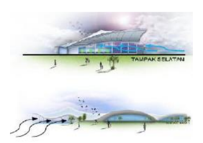
Figure 10 Air circulation in the building was designed to use natural air circulation elements