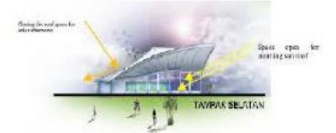
Figure 7 open roof shape oriented in natural light (east)

Figure 7 shows the open open roof shape oriented in natural light (east) and Figure 8 shows the reflection of light that comes from the pool, can enrich the light inside the room.