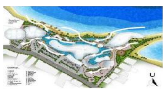
Figure 9 Arrangement of the building at the site, following the pattern of wind movement

Air circulation in the building was designed to use natural air circulation elements, like windows, vents, and void. This condition is reinforced by the existence of a pool that is capable of cooling the air in the room. For special enclosed space such as auditorium, using artificial air circulation (air conditioner) as well as on the first floor which is located in the basement and surrounded by fish ponds. Figure 9 shows the arrangement of the building at the site, following the pattern of wind movement. Figure 10 shows the air circulation in the building was designed to use natural air circulation elements