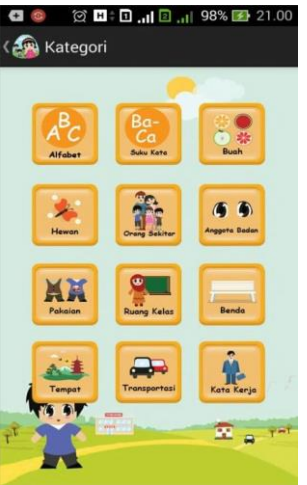
Figure 8 Choosing Category