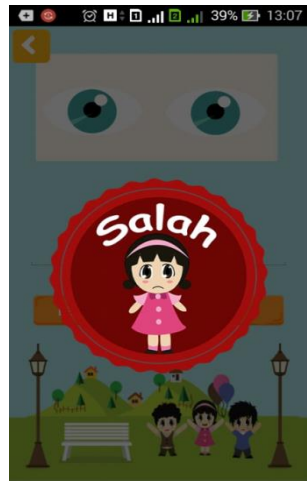
Figure 7 Wrong Answer