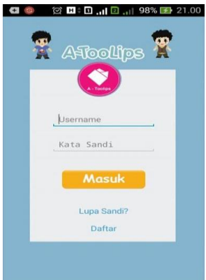
Figure 2 Login Page

On the other hand, Figure 8 shows the option category, Figure 9 shows the studying word, Figure 10 demonstrates the leveling available and last but not least Figure 11 visualizes the sub-level available.