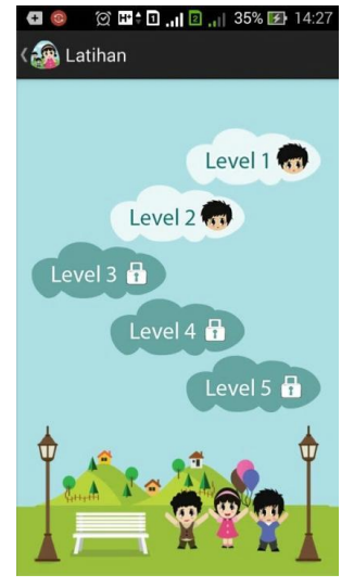
Figure 10 Leveling