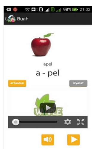
Figure 9 Studying Word