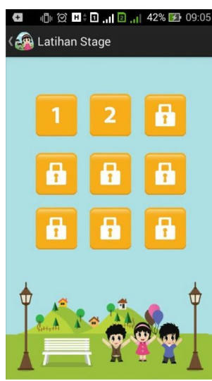
Figure 11 Sub-Level