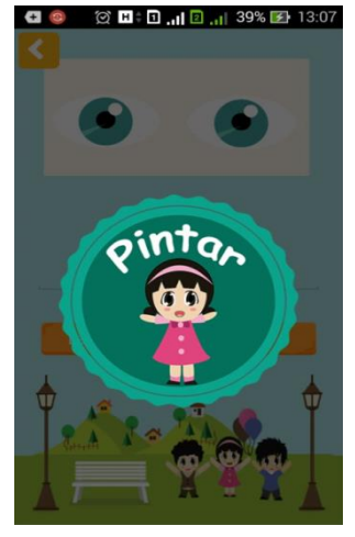
Figure 6 True Answer