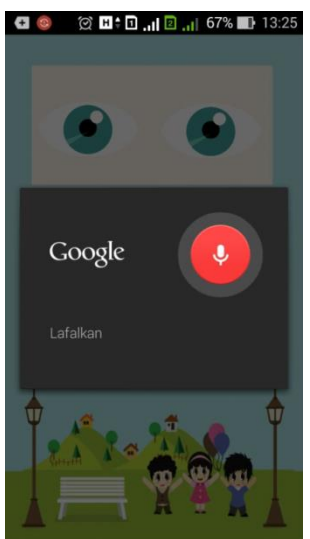
Figure 5 Input Voice