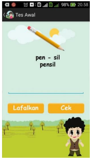
Figure 4 Initial Test