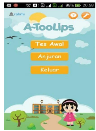
Figure 3 After Login