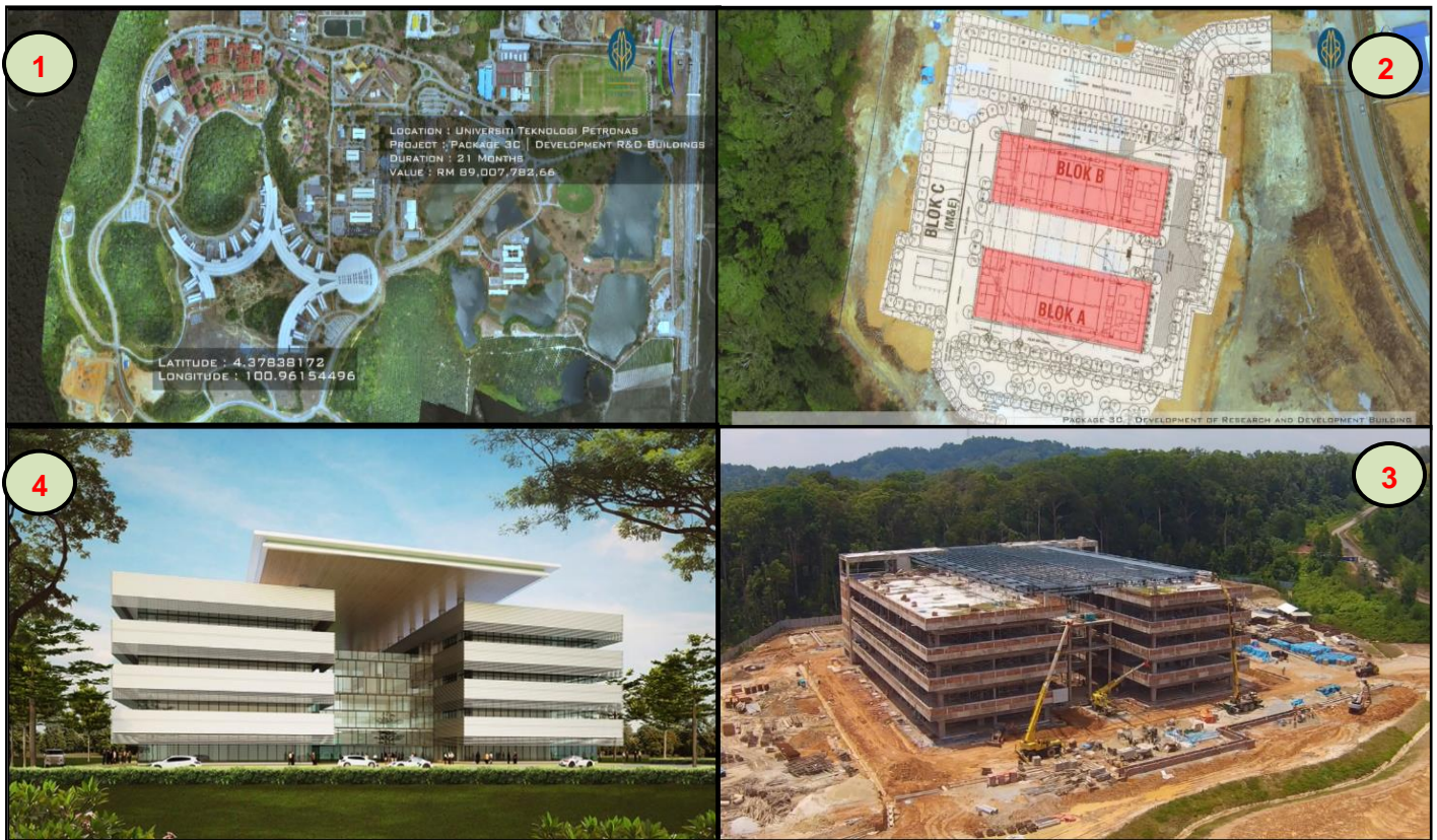
Figure 1 Construction site, UTP R&D

In cases where the life-cycle of the material, from removal from the nature to their end destiny, is carefully analyzed, a lot of resources could be preserved.