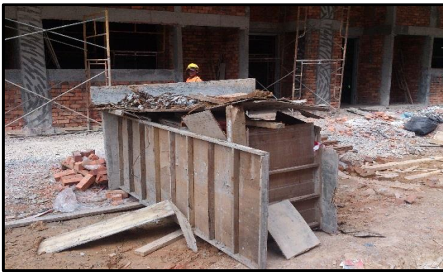
Figure 2 wood waste bin

The UTP R&D Project focused on both minimizing the amount of waste generated and diverting as much waste as possible from landfill. On-site, the construction manager was designated to be in charge of waste management. In this site the construction manager developed a brief waste minimization plan prior to the project commencement and briefed all sub-contractors on their responsibilities. One point of difference in this study was the absence of a conventional skip. The only bin on-site was for timber as presented in Figure 2. All other waste was collected and dealt with instantly.