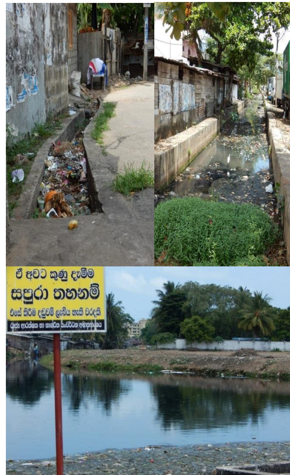
Figure 1 Micro Drainage Channel, Secondary Drainage Channel and Receiving Water body of the study area

Figure 1 shows micro drainage channel, secondary drainage channel and receiving water body of the study area. due to the migration into city in the last decades, the land area for canal reservations of the city have been disturbed by illegal developments. this caused enormous difficulties in canal maintenance and reduced in the carrying capacities of the canals. Rapid development happens within the municipality has created more impervious areas. It caused less infiltration and increased surface runoff volumes. Dilapidated drainage infrastructure was unable to handle the increased volume of surface runoff. This situation leads to pluvial floods even after a small rainfall event.