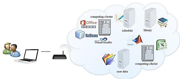
Figure 2 Organization learning scheme

To improve the quality of service in the private educational system, there were introduced cloud control events and incidents in accordance with the basic principles of IT Service Management.