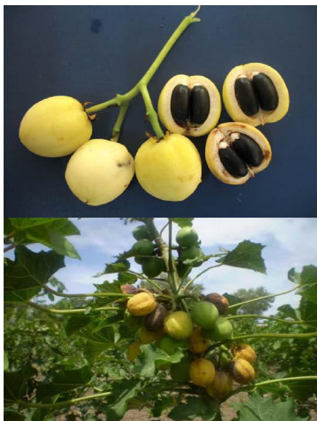
Figure 1 Jatropha plant and seed

forecast of 160 million tons of seeds from 32.72 million ha cultivated worldwide by 2017. Jatropha is a genus of approximately 175–200 plants [9, 13, 14], shrubs, and trees adapted to arid conditions, which can easily be propagated by cutting, and is extensively planted with a built-in capacity to combat desertification by restoring vegetative cover. Jatropha seeds contain around 47.25 \pm 1.34\% of crude oil, the remainder being proteins ( 24.60 \pm 1.40\% ), water ( 5.54 \pm 0.20\% ), crude fibers ( 10.12 \pm 0.52\% ), ash ( 4.50 \pm 0.14\% ) and carbohydrates 7.99% by difference. The plant is also relatively drought resistant and has potential for controlling soil erosion and increasing the habitat of wild animals. The plant does not require any particular soil type for growth, can flourish on almost any soil composition, and can produce seeds containing up to 40% mass of oil [15-17].