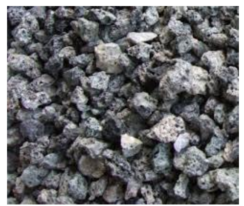
Figure 1: POC used in concrete mix