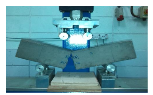
Figure 2: Broken prism sample after flexural test