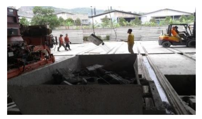
Figure 3: Operator directed the concrete remnants without using safety devices

From the analysis above, risk factors in the process of mould cleaning are: