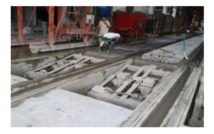
Figure 2: Operator cleaned the mould without using gloves

After the manufacturing process of HCS, the operator cleaned again the mold by removing 50-cm concrete remnants from the end of the lane by using a hoist. This process is also assisted by an operator who directed the concrete remnants to the disposal site. Based on the field observation the operator did not use safety devices such as helmet and gloves to protect his body from the wire that comes from the concrete (Figure 3). If this thing happened, this can cause injury to the hand, head and other body parts.