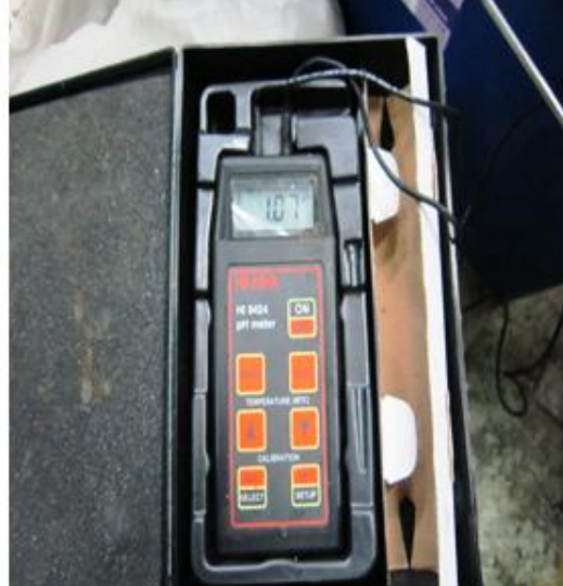
Figure 1: A pictorial view of acid sulphuric attack and pH test in progress